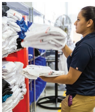
ATTENTIVE, DETAIL-ORIENTED STAFF