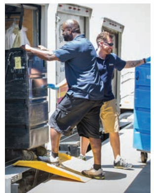
SMALLER TRUCKS FOR MORE FREQUENT DELIVERIES